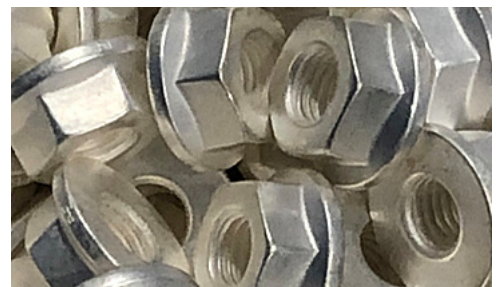
Barrel Silver on Stainless