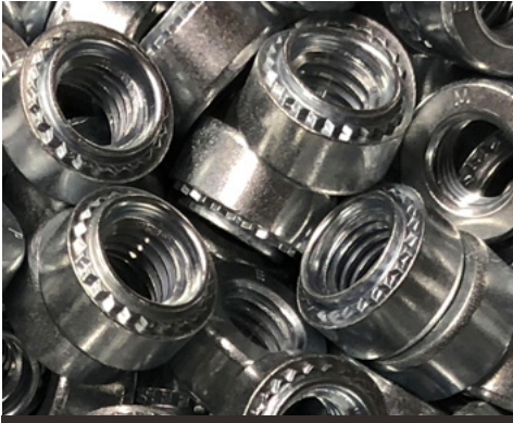
Barrel Zinc Clear