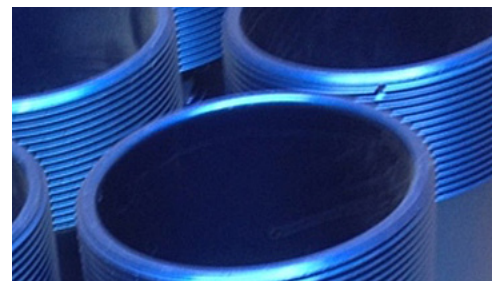
Sulfuric w. color