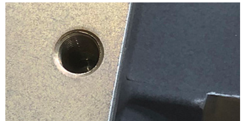
Sulfuric/Chem Film Dual Finish

"We have entrusted our plating work to Erie Plating for more than 30 years... Having worked with them so closely my whole career, there is no other company I could endorse as strongly."