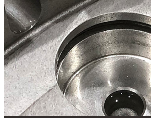
Sulfuric - Clear Finish

Need To Solve a Tough Anodizing Problem?