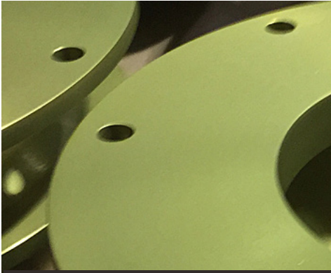
Chromic - Dichromate Seal