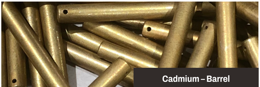
Cadmium – Barrel

"We have entrusted our plating work to Erie Plating for more than 30 years... Having worked with them so closely my whole career, there is no other company I could endorse as strongly."