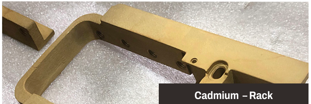
Cadmium – Rack