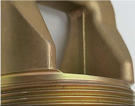
Cadmium Yellow Chromate